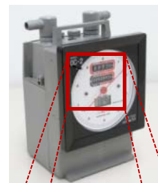
W-NK-1 with resettable counter